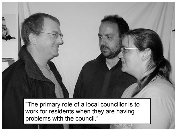
"The primary role of a local councillor is to work for residents when they are having problems with the council."

This would be my number one priority if I were elected a councillor for Chells.