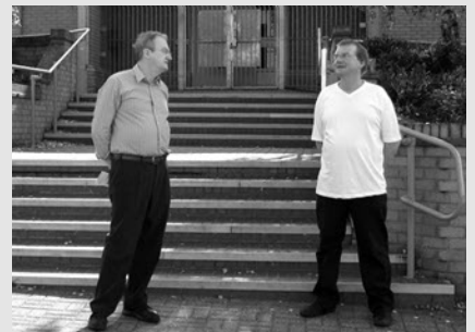
The Lib Dem Team are working for Chells

£2,500 to the Chells Pavilion to create safe and secure outdoor areas for children and toddlers who use the facilities.