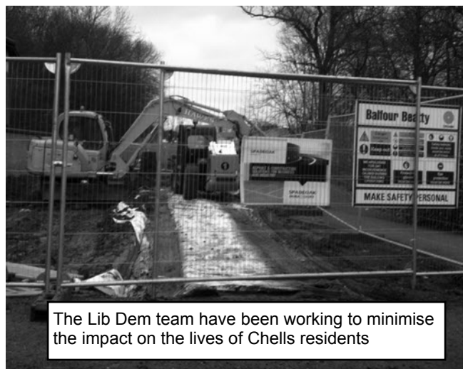
The Lib Dem team have been working to minimise the impact on the lives of Chells residents

Many remember the mess the roads were left in when the Marriotts Gym was built.